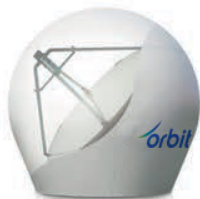
Gaia 100 3.7 m