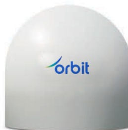
Gaia 100 4.5 m