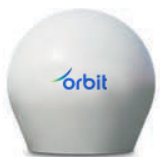
Gaia 100 2.4 m

The Gaia 100 family is available in 4 antenna sizes: