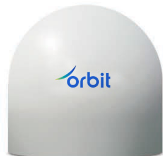
Gaia 100 5.5 m